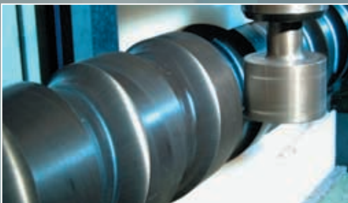
5-axial CNC production