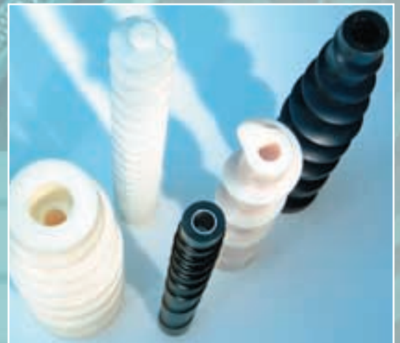
Made-to-measure screw conveyors