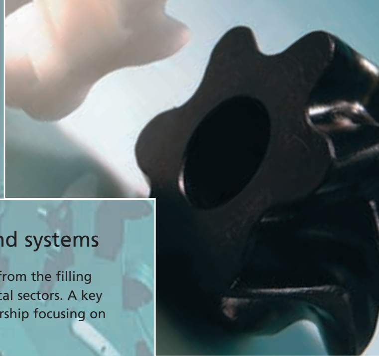
Precision production: pump wheel