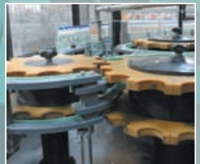
Star-pattern conveyor for separating bottles