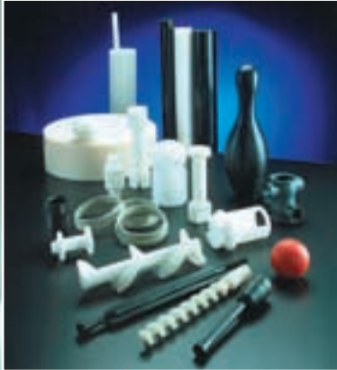
Component / spares production / small series

In addition to selecting the right material, expert preparation and then machining are vital aspects. Our high-tech machinery, comprising