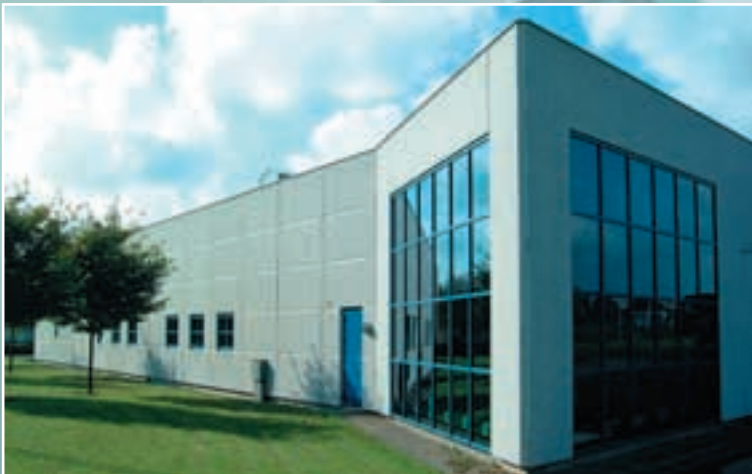
The company's head office, warehouse, design centre and production shop

Our reputation as an expert for special mechanical engineering components extends well beyond Denmark. Hand in hand with the customer, we develop and implement customer-specific concepts that go way beyond the customary standard, involving everything from the selection of the materials to the configuration, precision production and assembly in situ.