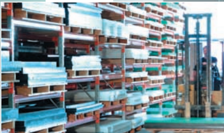
The call-off warehouse with over 1000 m 2

Thanks to our call-off warehouse with an effective floor area of over 1000 m 2 , we are able to keep delivery times short.