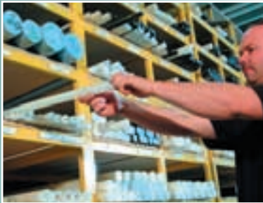
Expertise in material selection

From semi-finished articles sourced both from within the group and from third parties, we are able to supply solid rods, hollow rods and sheets made of