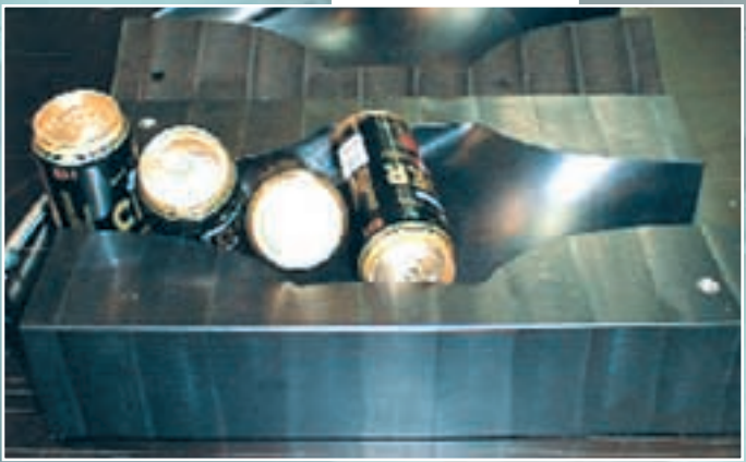
A glimpse inside a can twister